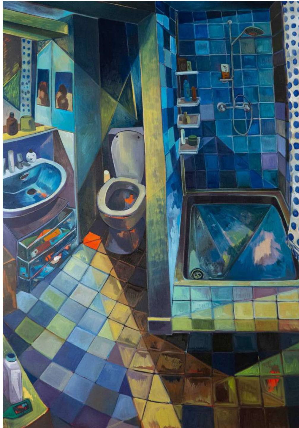
Chez Louiz oil on canvas, 100x150cm 2025