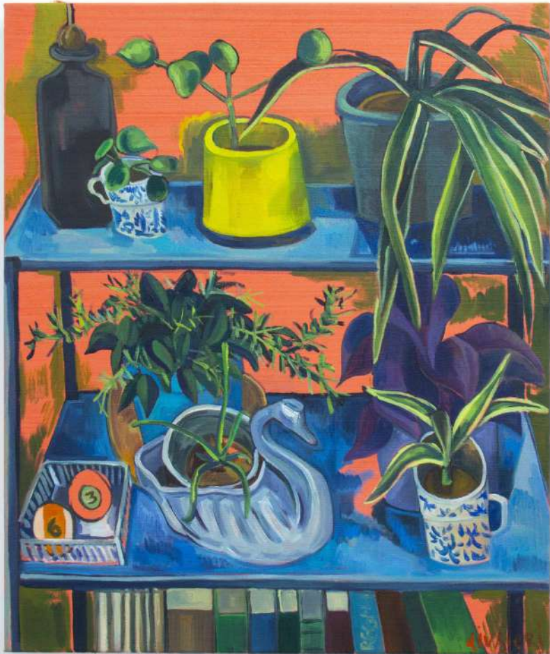
Les chasseurs Ardennais oil on canvas, 50x60cm 2025