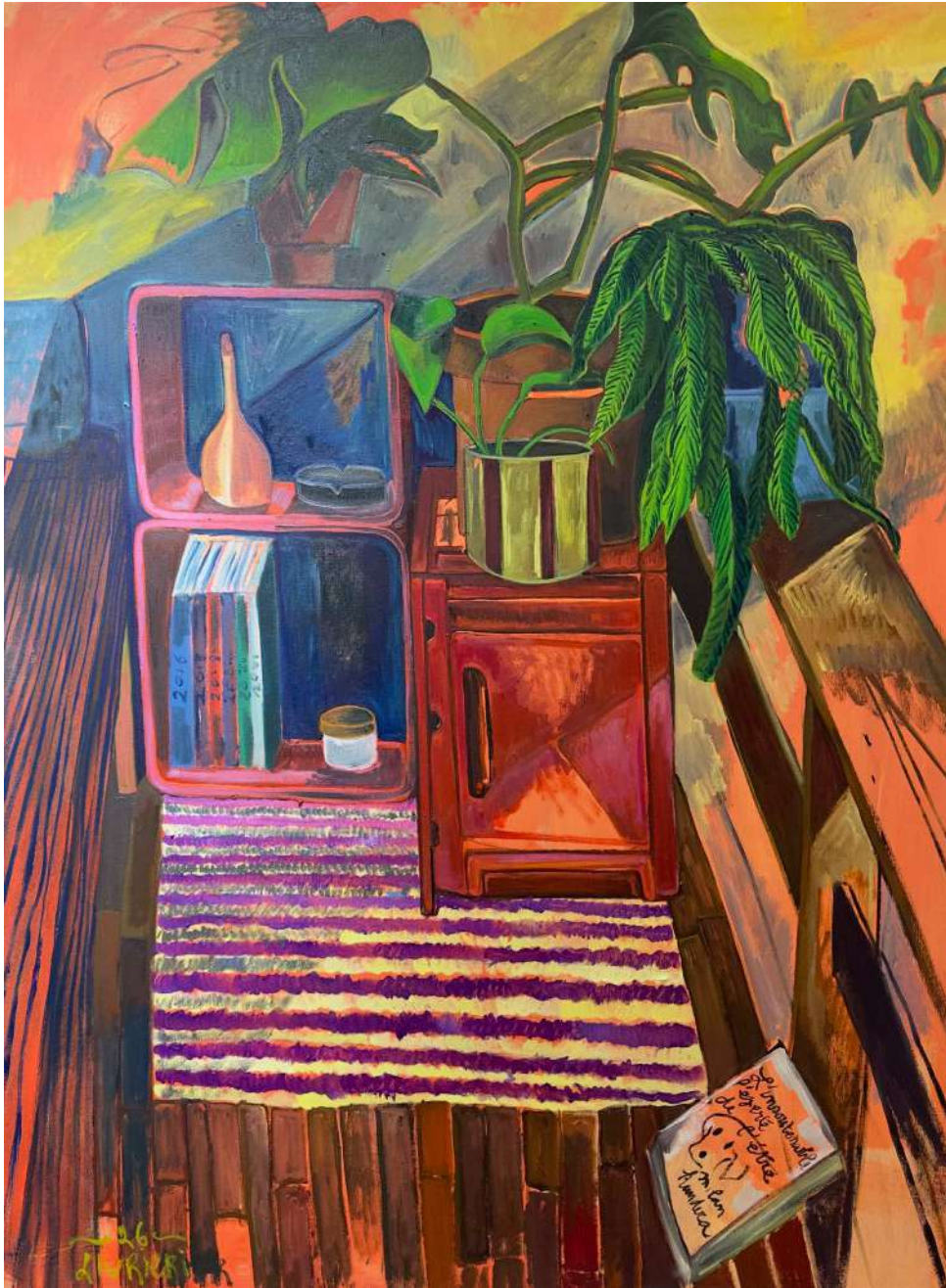
L'insoutenable l'égereté de l'être oil on canvas, 120x90cm 2026