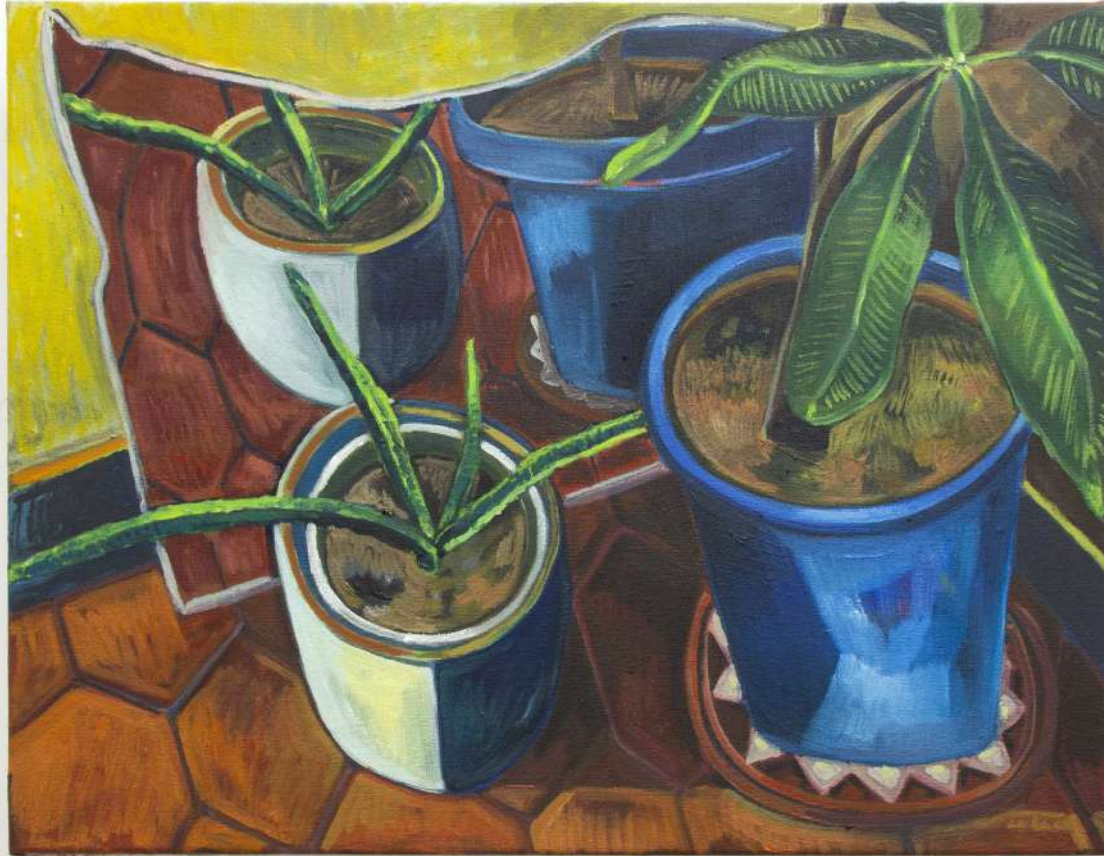
Chez Nemavo oil on canvas, 190x130cm 2025