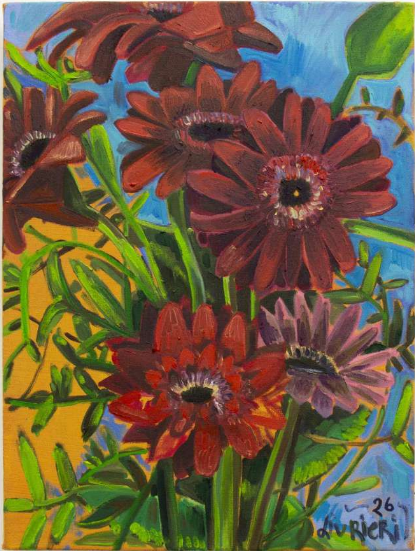
Ça m'a échappé oil on canvas, 44x34cm 2026