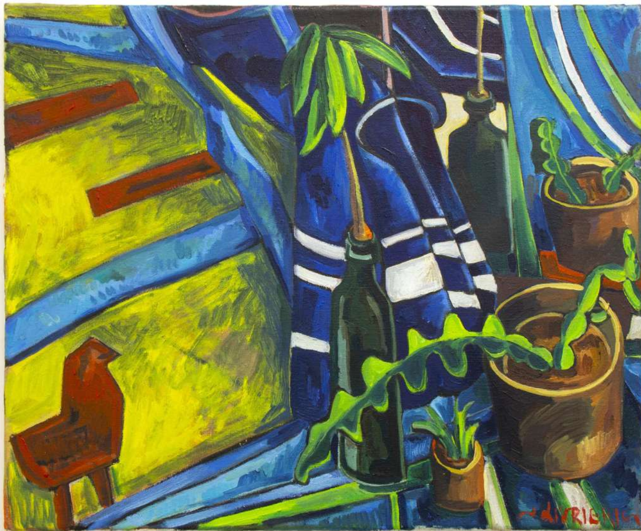
La simplicité oil on canvas, 50x40cm 2025