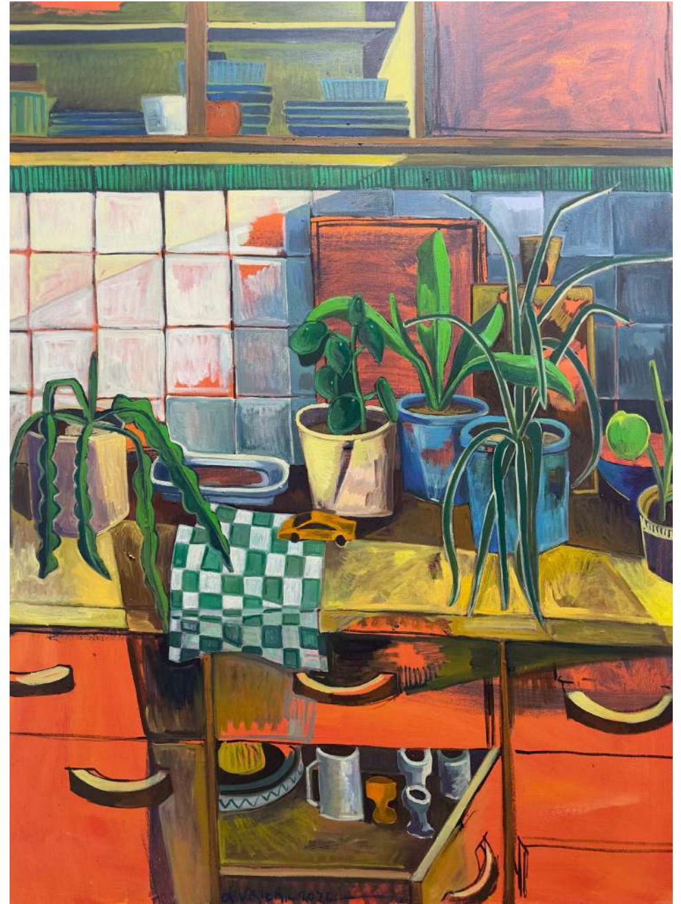
La cuisine oil on canvas, 120x90cm 2026