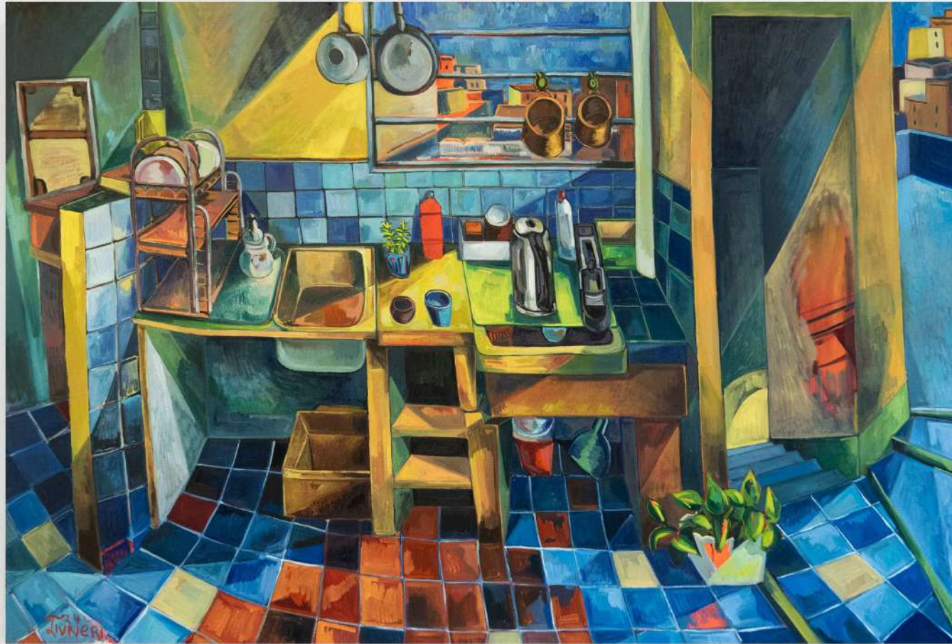
Le musée de l'Âne oil on canvas, 190x130cm 2024