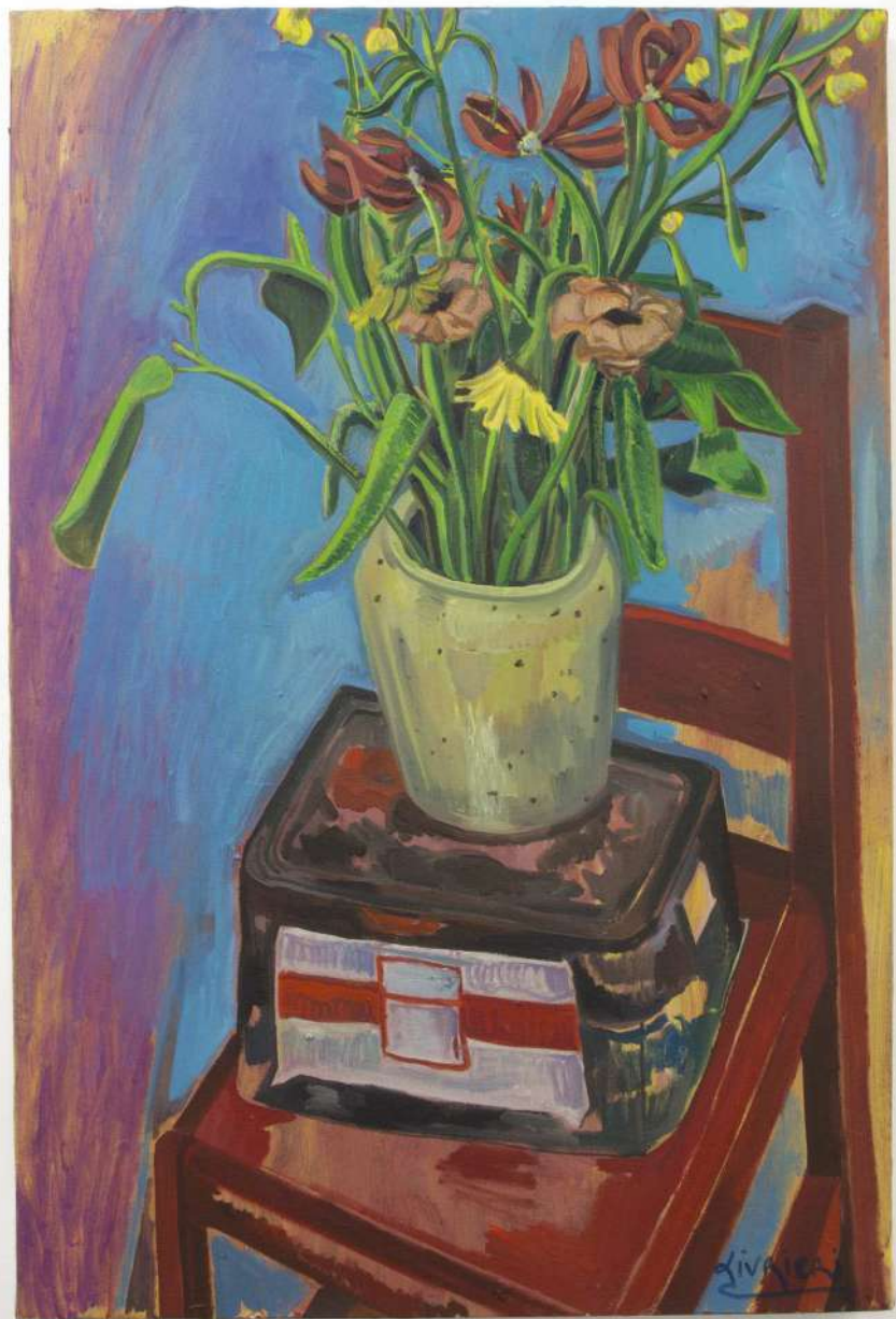
Superposition des idées oil on canvas, 60x90cm 2026