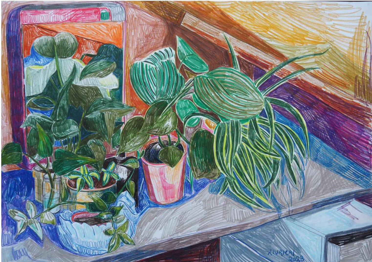
Le Grenier colored pencil on paper, 59.7x42cm 2023