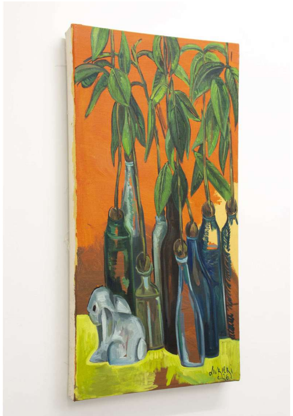
Les avocats de la Daronne oil on canvas, 40x70cm 2026