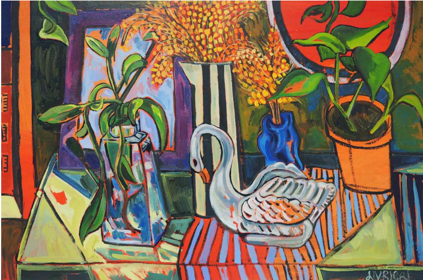
Chez Jade oil on canvas, 120x80cm 2023