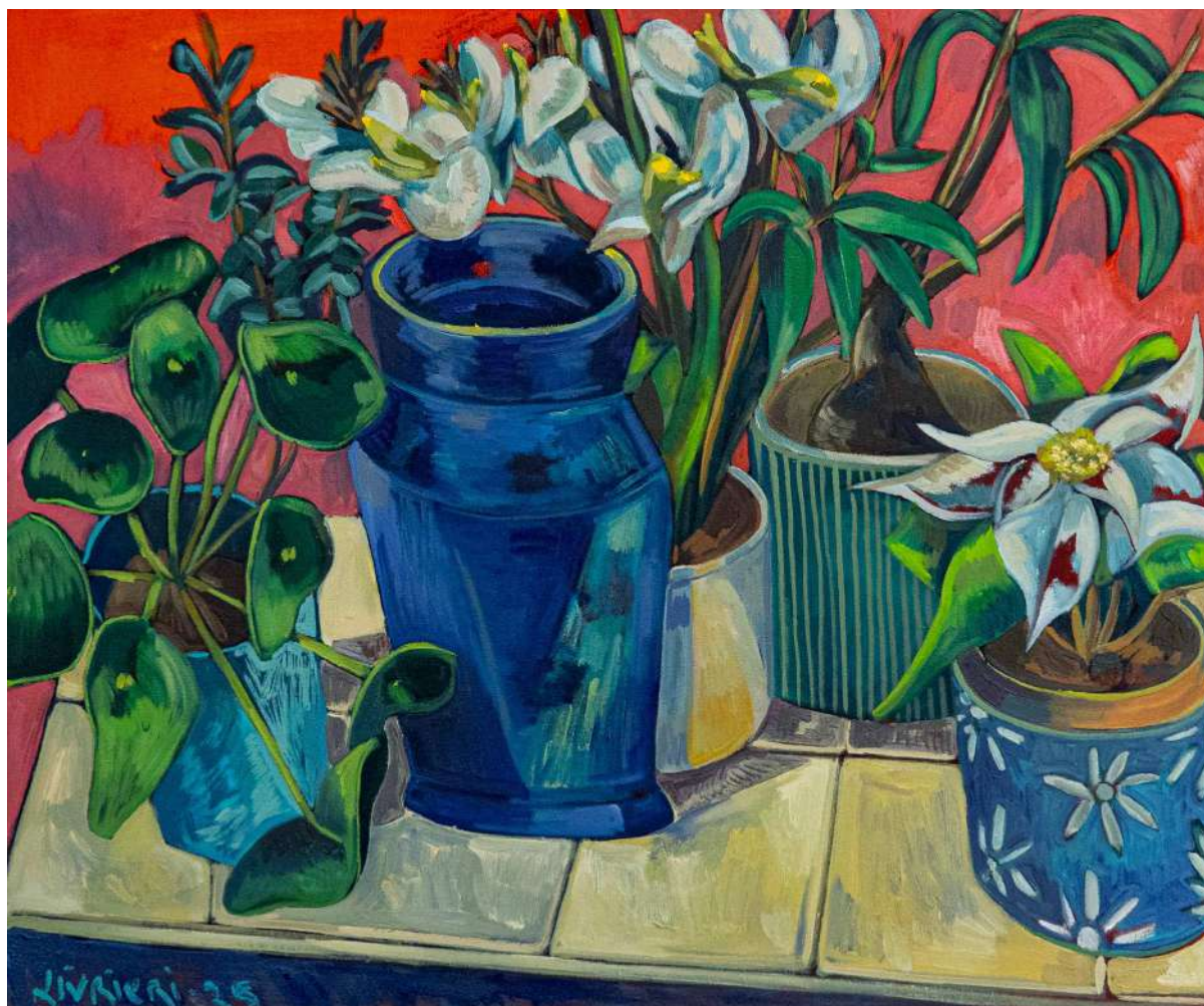
Chez la maman de PH oil on canvas, 60x50cm 2025