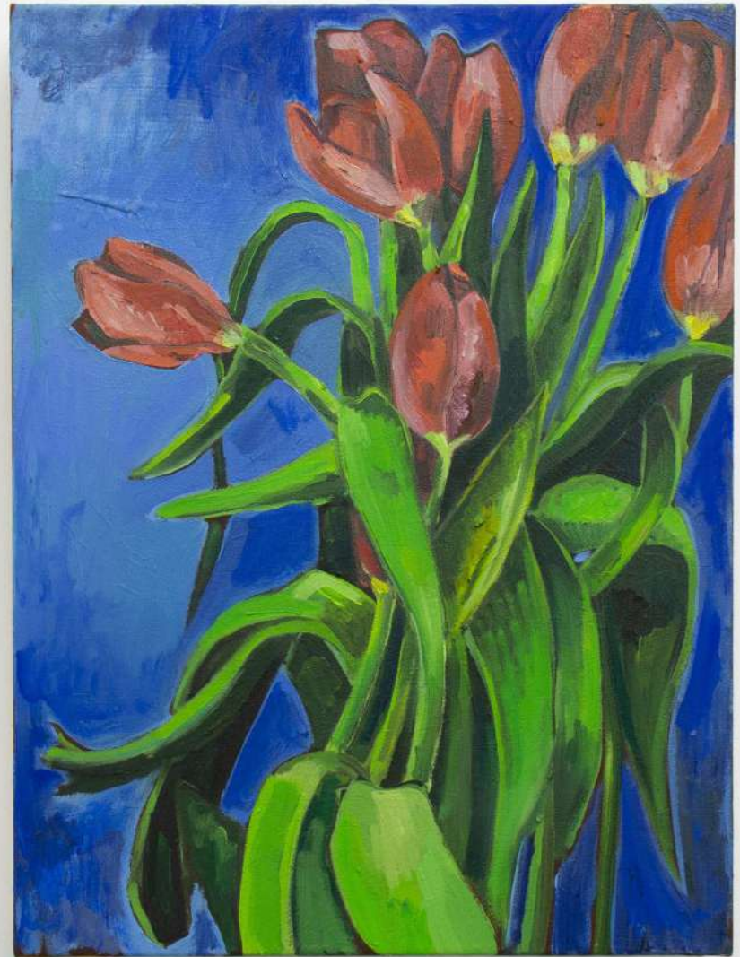
Au réveil oil on canvas, 44x34cm 2026