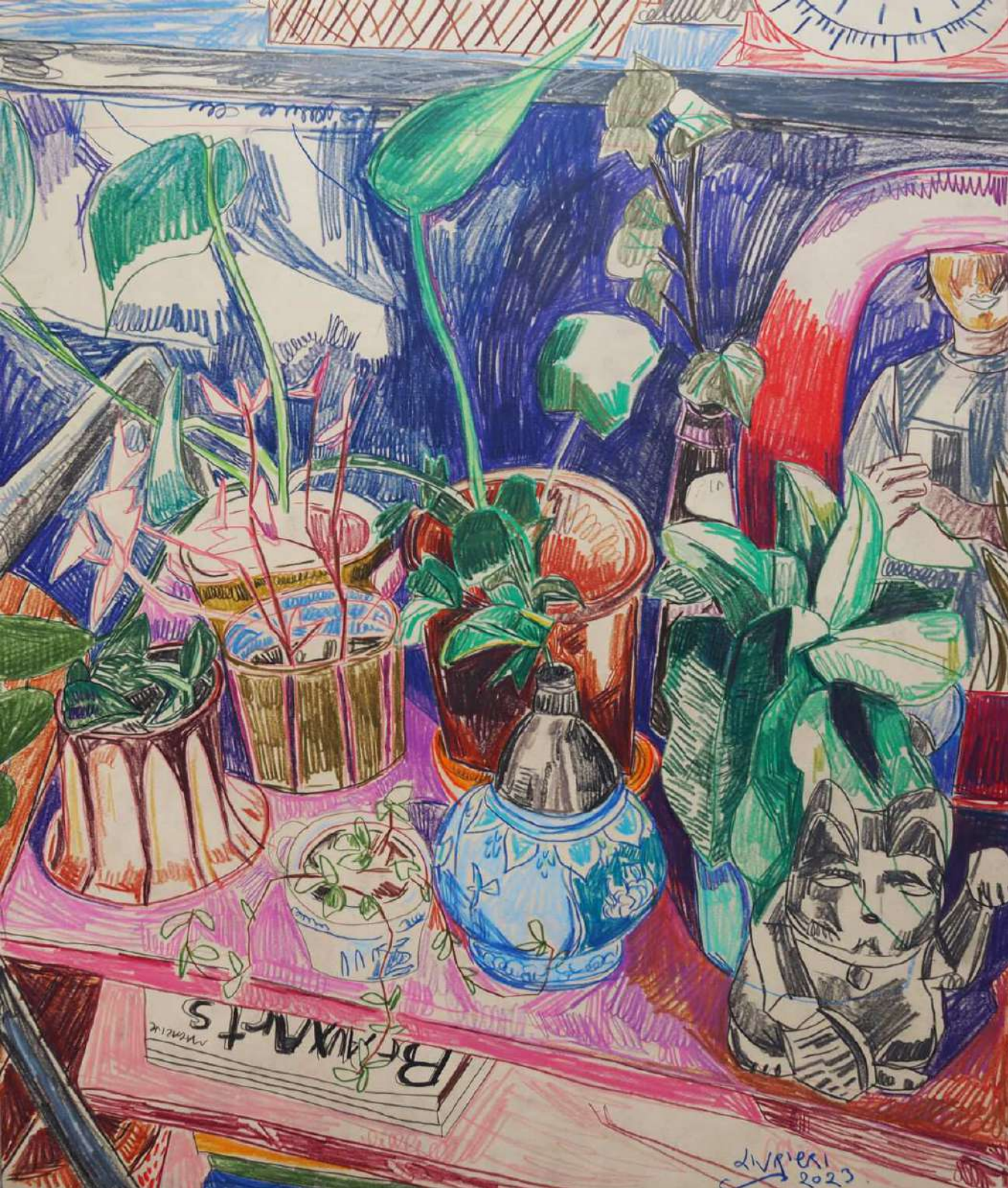
Les plantes de Olga oil on canvas, 50x60 2023