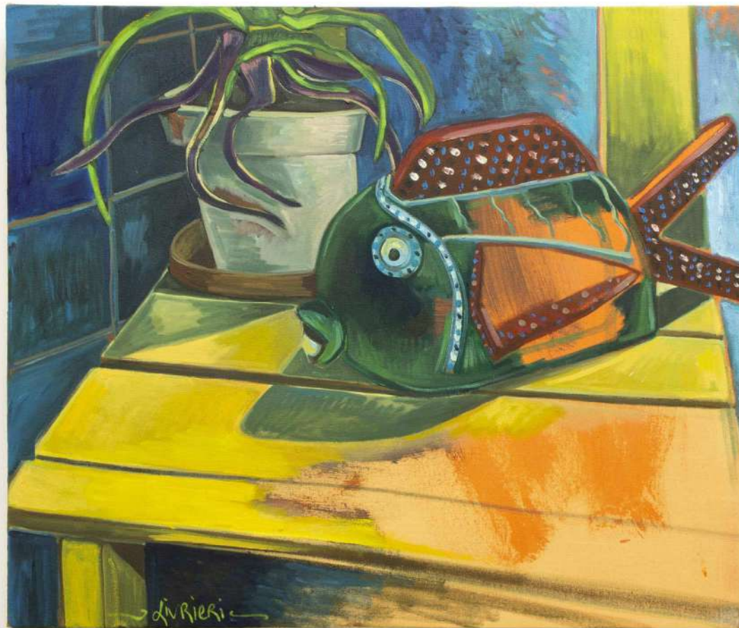
Le gros poisson oil on canvas, 60x50cm 2026