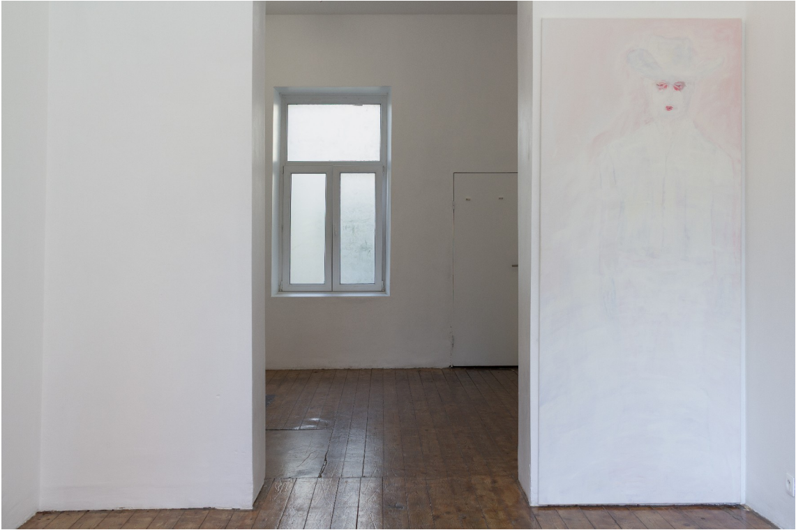
Oilpaint on canvas 100 x 240 cm