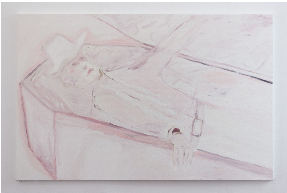
Oilpaint on canvas 170 x 110 cm