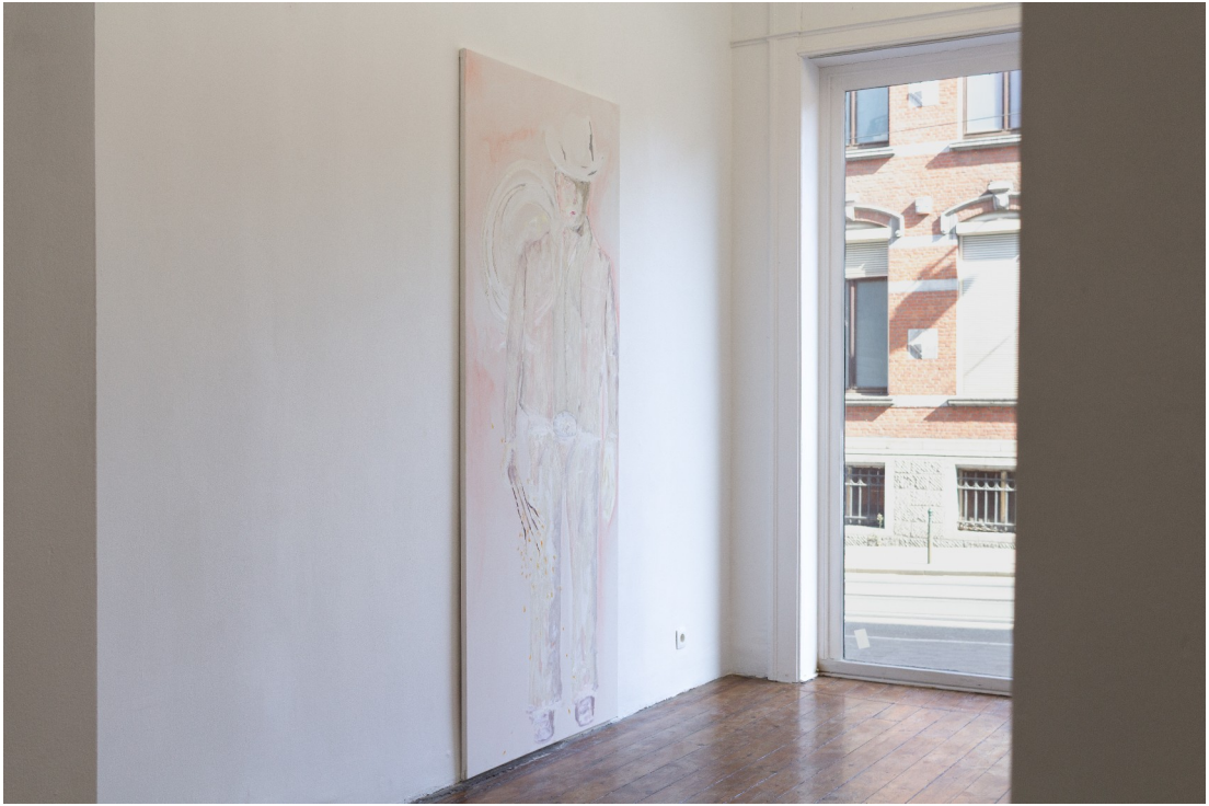
Oilpaint on canvas 100 x 240 cm