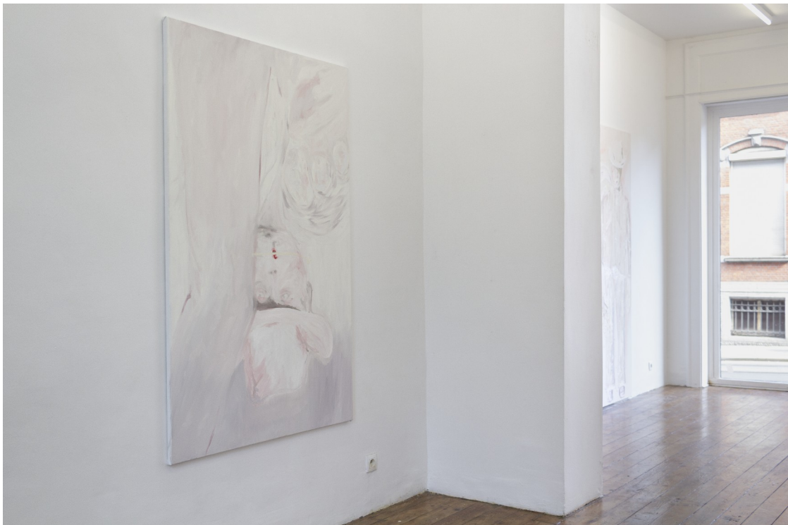
Oilpaint on canvas 170 x 110 cm