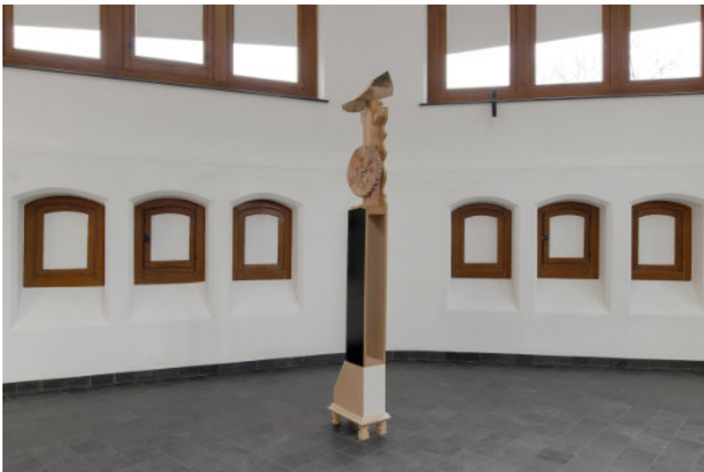
Exhibition: Upside down, In light of shadows , KIOSK, Ghent/BE (solo) 2024