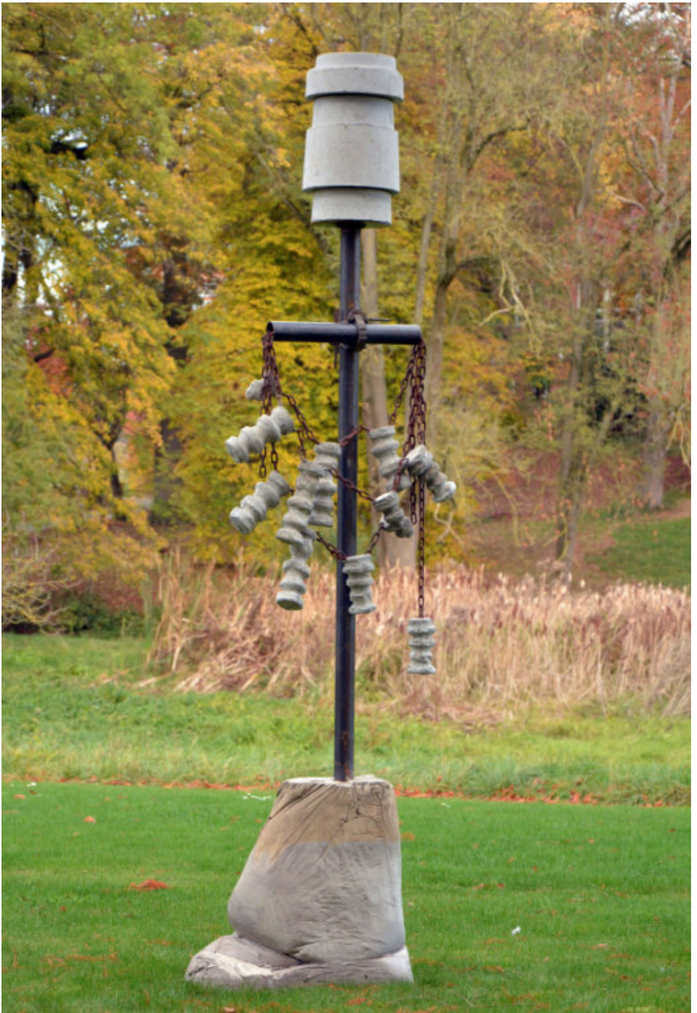
#BALUSTER#OfraHaza 2018 240 x 40 ø reinforced concrete, steel_