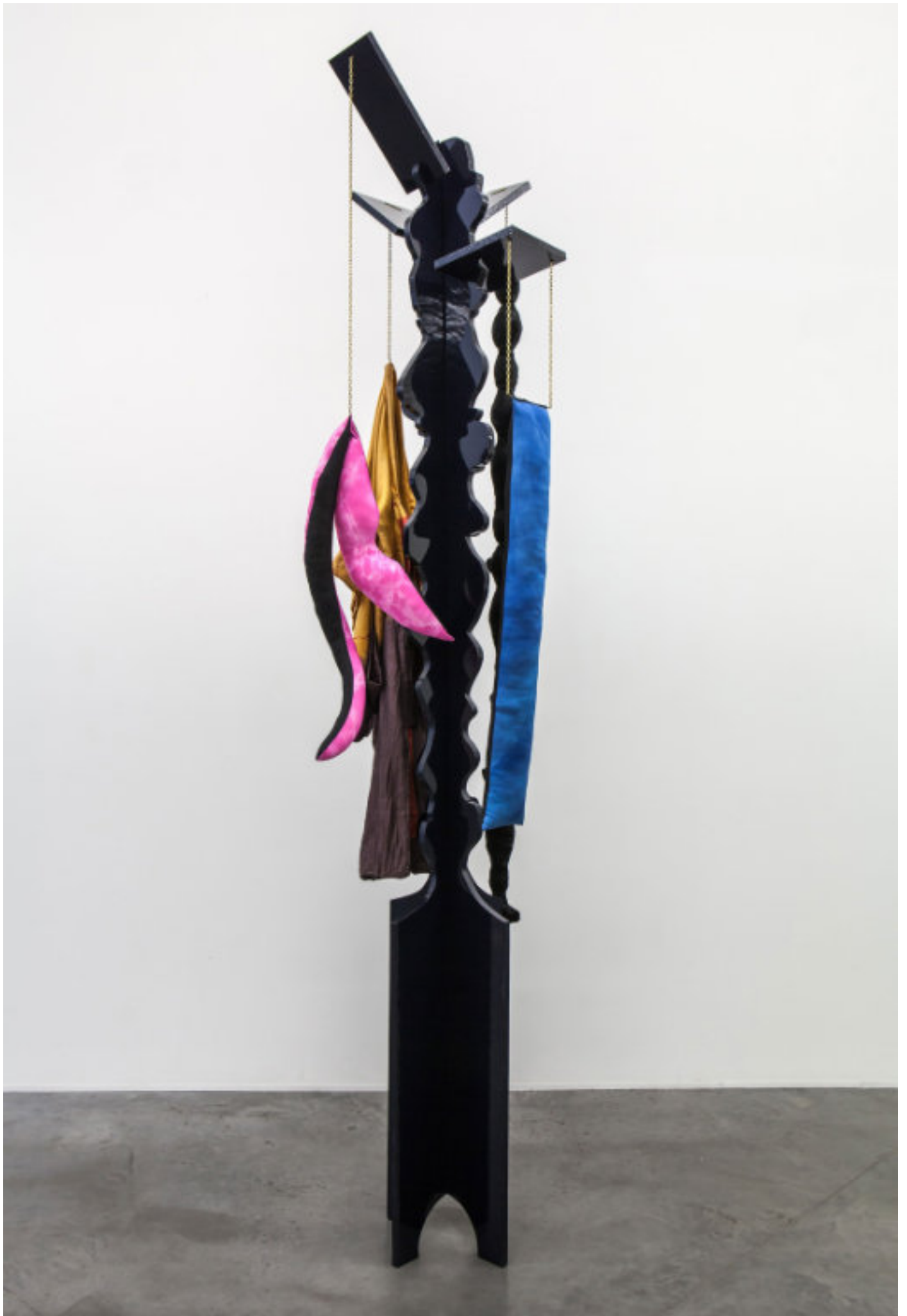
#BALUSTER#SeiShonagon 2015, 240 x 60 ø wood, messing, dyed silk and kimono textiles.