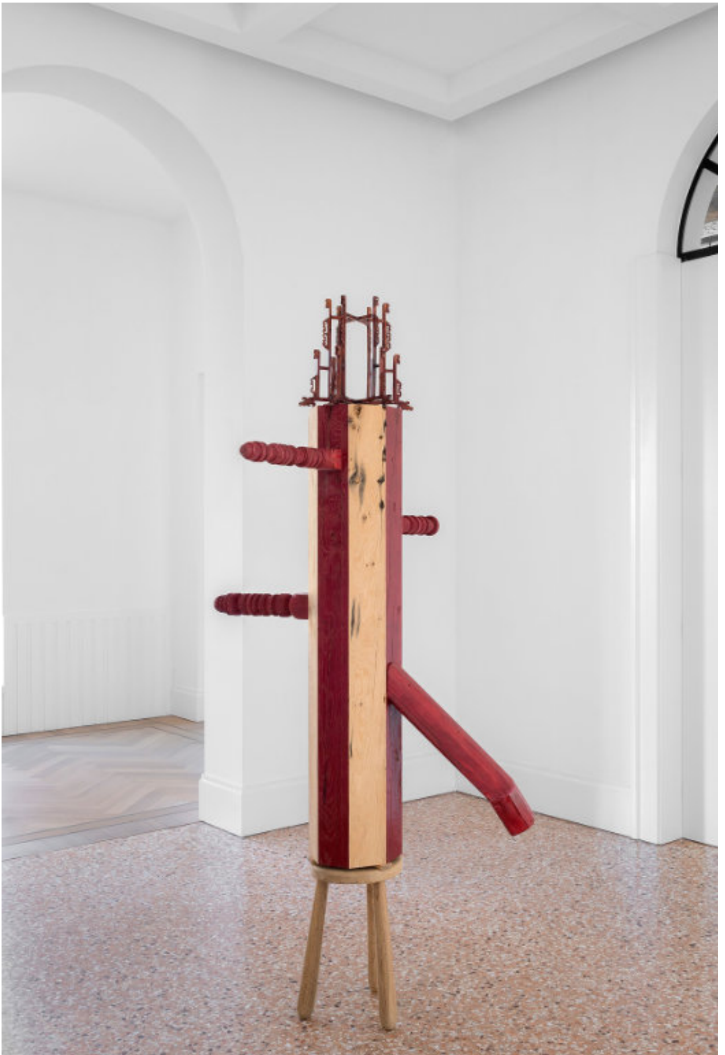
#BALUSTER#JackieChan 2016, 185 x 70 oak, antique furniture, red alkyd lacquer