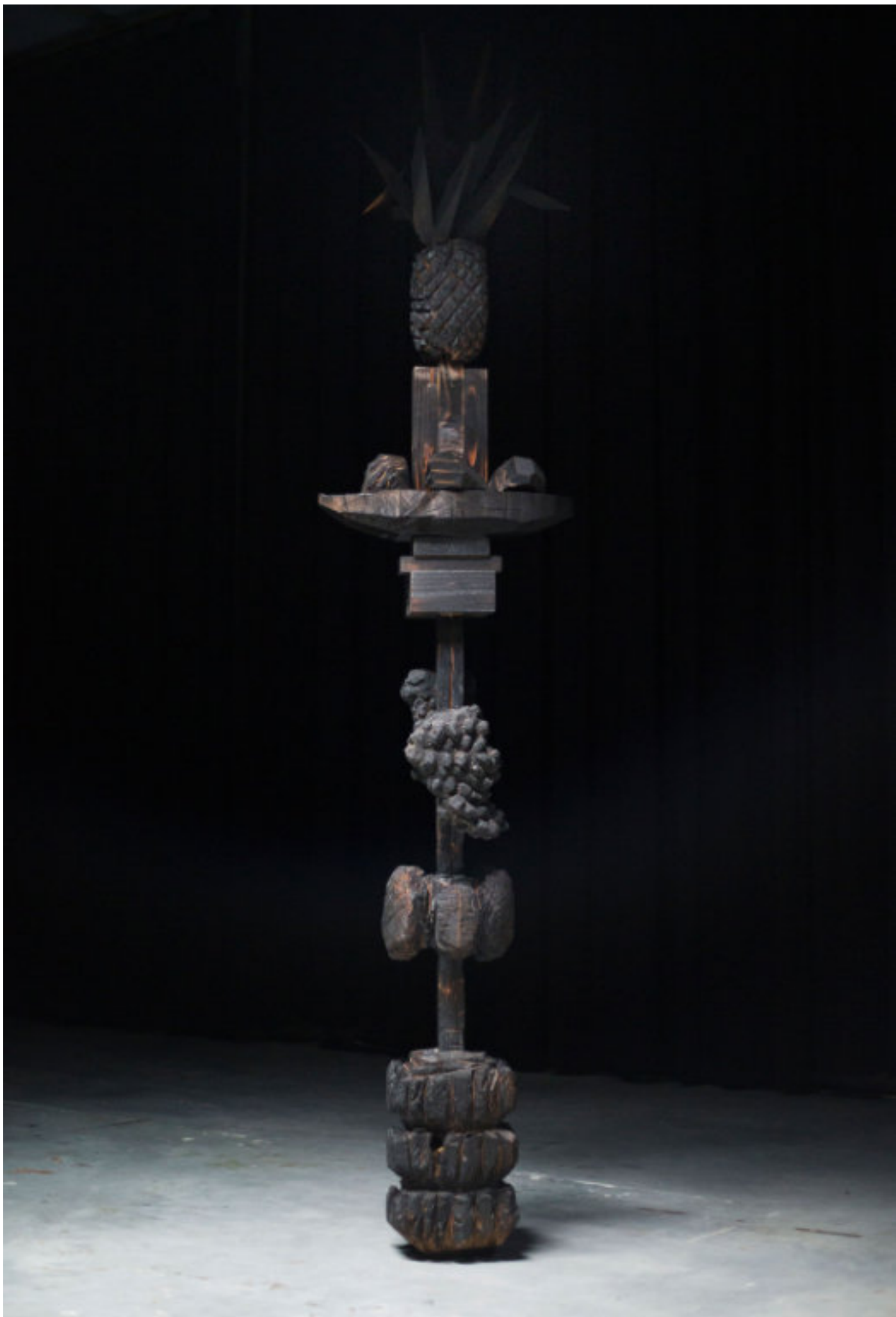
#BALUSTER#CarmenMiranda 2015, 250 x 50 ø, scorched wood