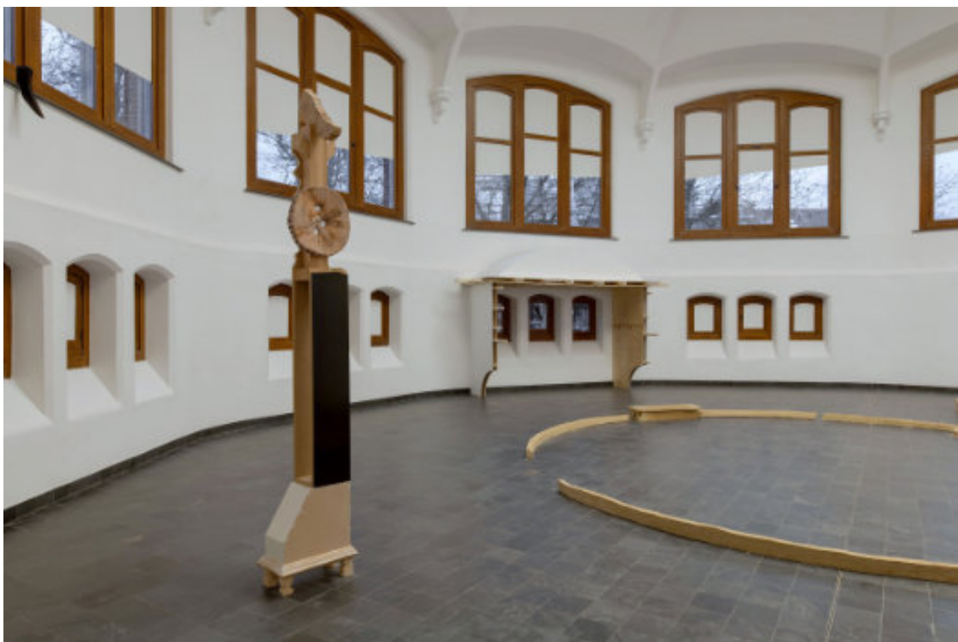
Exhibition: Upside down, In light of shadows , KIOSK, Ghent/BE (solo) 2024