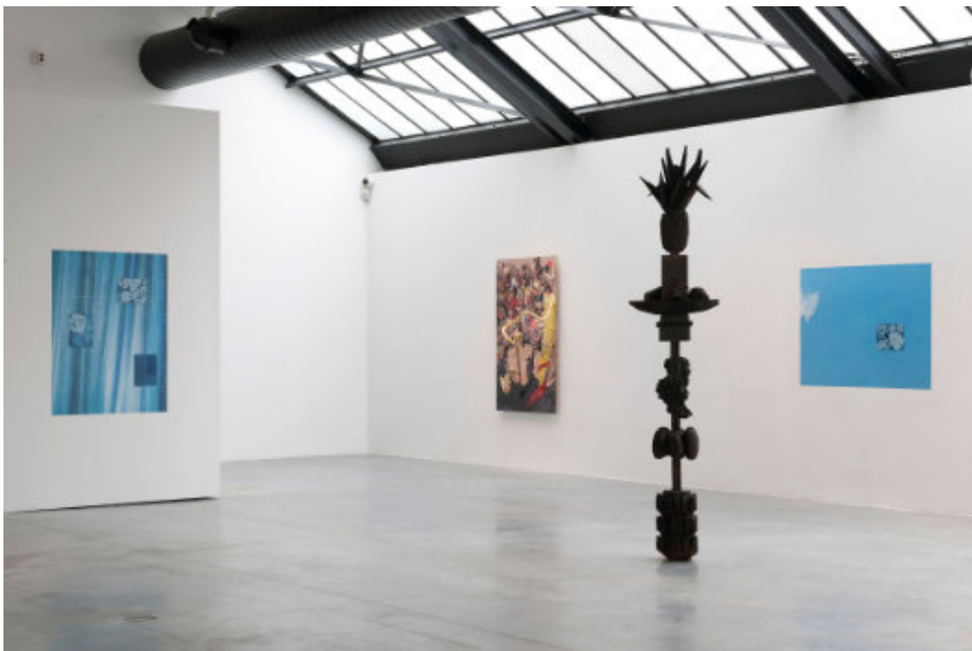
Exhibition: Dérive, Dérivée, CAB, Brussels/BE 2015