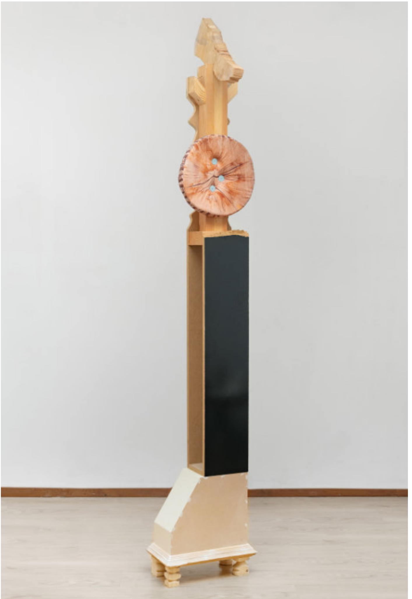
#BALUSTER#TheAutodidact 2021 various wood types, metal, textile, foam, alkyd resin, filler