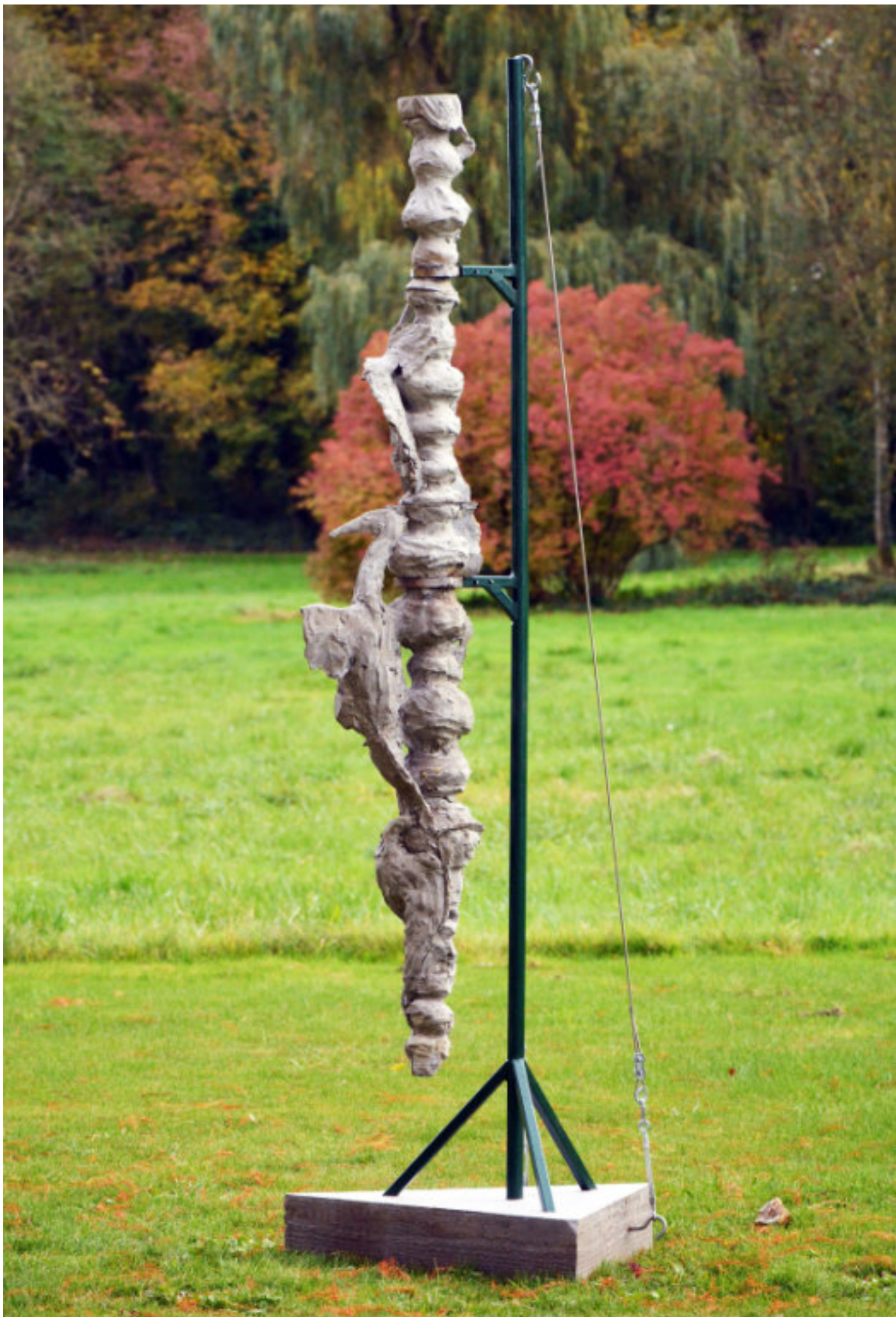
#BALUSTER#GrinlingGibbons, 2014, 200 x 50 ø reinforced concrete, steel, inox